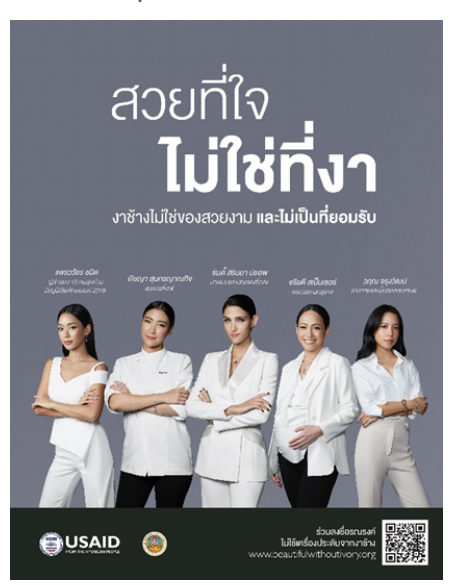
The case examples described in the SBCC Guidebook are based on the Beautiful Without Ivory demand reduction campaign.

https://cites.org/sites/default/files/notifications/E-Notfi-2021-038.pdf